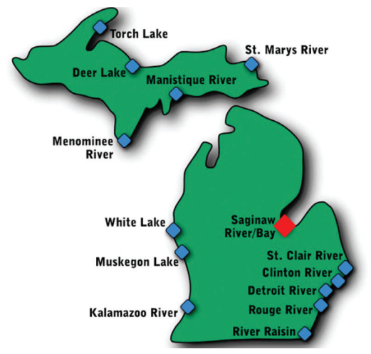
Figure 1-1: The Saginaw River/Bay Area of Concern

This guidebook presents simple, straightforward approaches for protecting water quality through local Master Plans and Zoning Ordinances in very rural places. It is targeted at Planning Commissioners, Zoning Administrators, and local elected officials in rural Michigan, and is applicable throughout the Midwest Great Lakes states. It is written from a practical