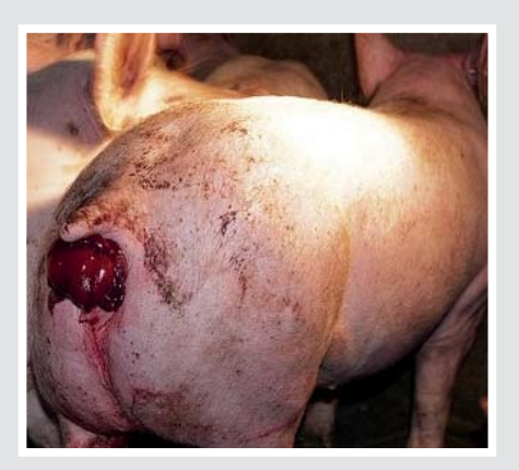
Figure 6. Rectal, vaginal, or uterine prolapses. There are numerous causes of rectal prolapse, including docking tail too short. Vaginal prolapse is uncommon and most often occurs in the 3rd

• Have these pigs overserved with prolapses been identified by caretakers and receiving attention?