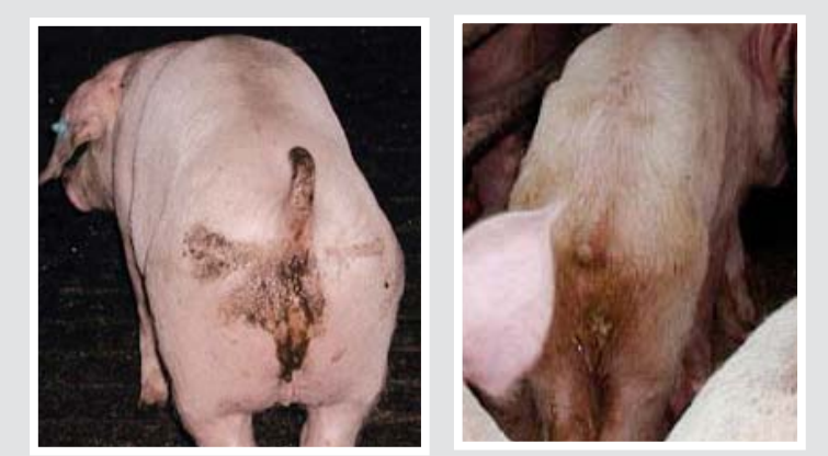
Figure 11.

<u>Figure 11.</u> Pigs with visible signs of diarrhea. Numerous causes for diarrhea exist. Causes can include nutrition, disease, parasites, etc.