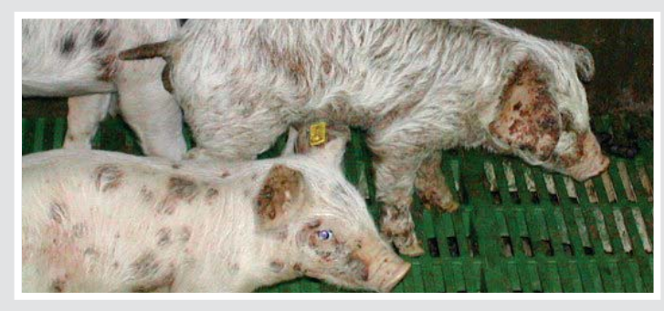
Figure 12.

<u>Figure 11.</u> Pigs with visible signs of diarrhea. Numerous causes for diarrhea exist. Causes can include nutrition, disease, parasites, etc.