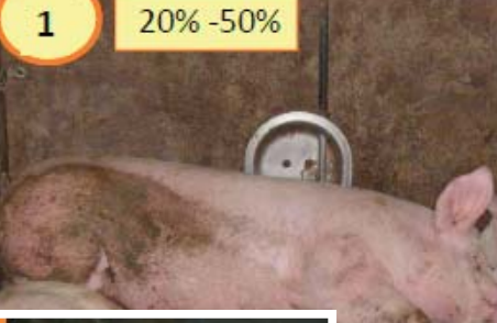
Figure 9.

<u>Figure 9.</u> Excessive amount of manure (not mud) present on body (percentage of manure covering body). Pigs prefer to be clean. Large amounts of manure on body indicates that their environment is not adequate for allowing pigs to behave naturally. Pigs will lie in their excrement only if they are excessively warm or if they have too little space. Excessive amounts of manure can also