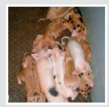
Figure 10.

Temperature guide based on floor type (please note that you must be aware of pig behavior and adjust accordingly).