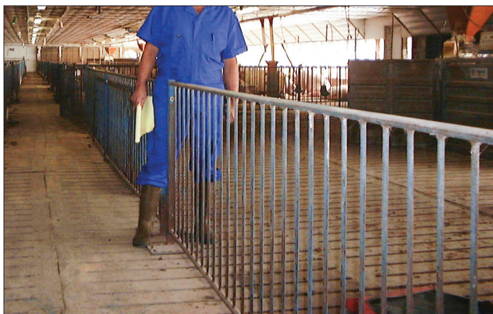
Figure 1. An example of a pass through gate for sow pens.

tions. This will allow them to correctly assess the soundness of each animal and examine the area for equipment problems or failures. Pass through gating (Figure 1) is very convenient for people to move in and out of pens, thus reducing the hesitation of stockpeople to enter pens and evaluate sows.