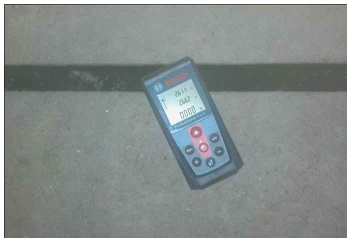
Figure 1. An example of a electronic laser to measure free-board in a hog barn pit.

As any 8 year old boy will attest, a better alternative to the stick is a "laser" (Figure 1).