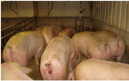
4a. Dominate sow working through group while feeding.