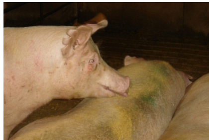
4b. Sow eating residual feed off of pen mate