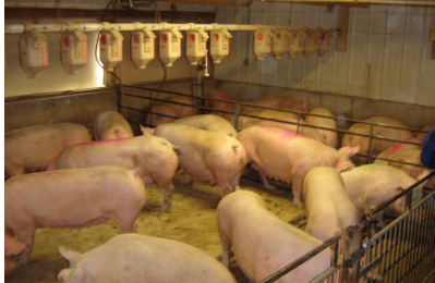
2a. Automated Feed