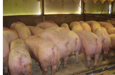
2b. Concrete Feeding Pad