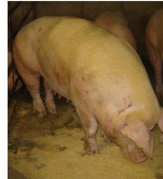
4c. Dominate, over-conditioned sow.