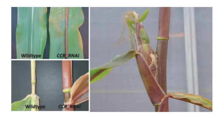
Figure 1. Presence of reddish-brown midrib, internode area on the stem, and husk covering the seeds in CCR down-regulated maize plant. Wildtype: Control non transgenic; CCR_RNAi: CCR down-regulated transgenic maize.

CCR converts CoA-ester to aldehyde in monolignols biosynthesis pathways. In wheat, CCR is mostly expressed in stem, where it is progressively increased as the plant matures correlating with higher Klason lignin contents, and improving the structural strength of the stem.<sup>30</sup>