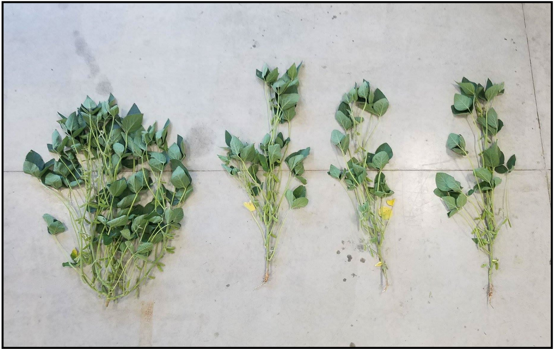
Figure 1. Soybean biomass accumulation at growth stage R2. Plants pictured (left to right) were seeded at 50,000, 90,000, 130,000, and 170,000 seeds per acre, Lansing, MI.