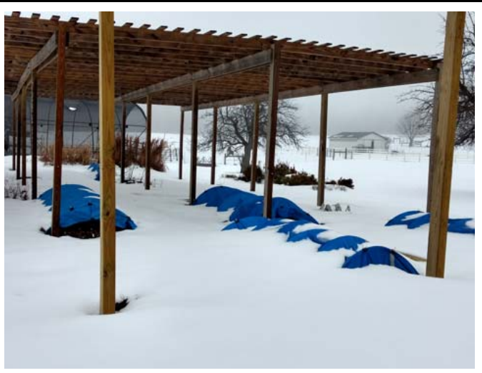
Blue Tarps Stretched over Metal Hoops Provide Additional Winter Protection for Selected Varieties