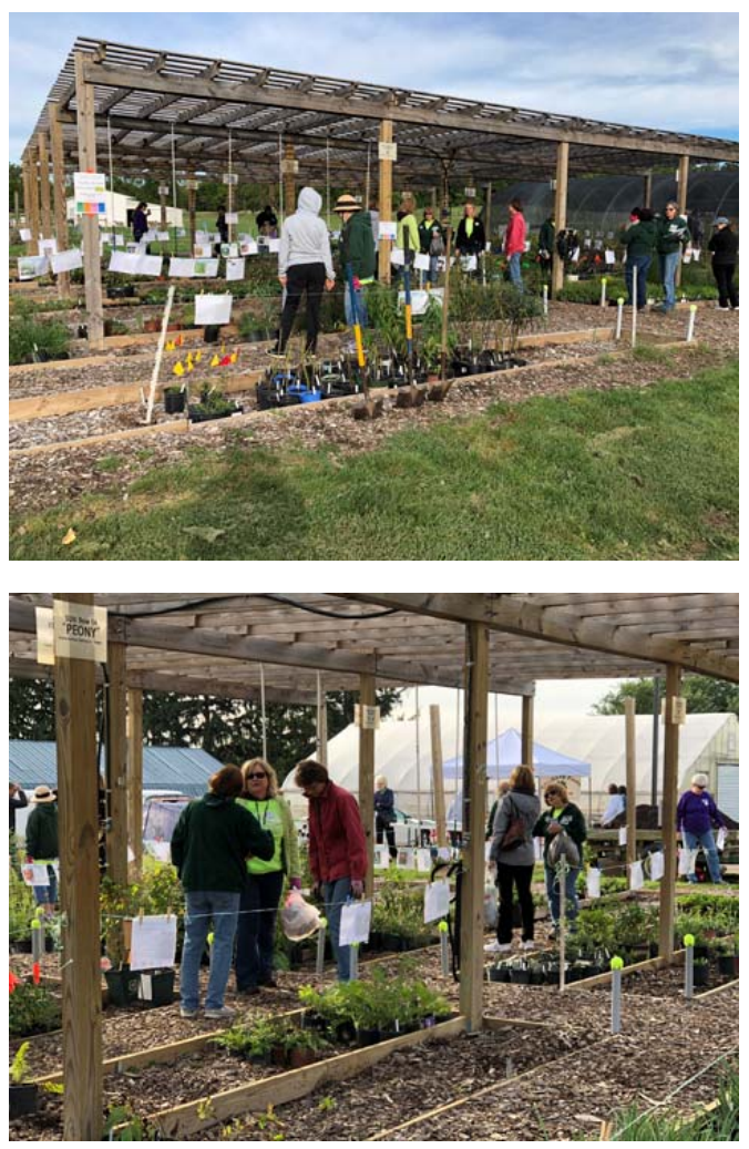
2019 Fall Plant Sale