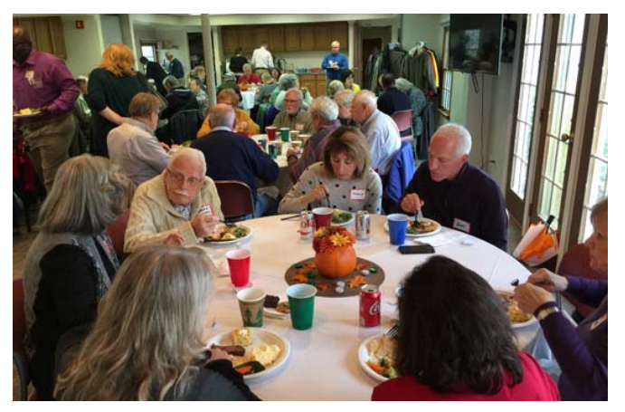
2017 Recognition Dinner

Recognition Dinner: The recognition dinner is coming up soon. Please reserve your calendar for Saturday, November 3rd starting at 4:00 PM. Every year I look forward to this event. It is wonderful to get together with the many people that have made the Tollgate gardens so beautiful all year. It is also great to see what everyone looks like when the dirt is scrubbed off! Support for the event and many of the thank-you door prizes are generously provided by the Americana Foundation . I look forward to a special evening.