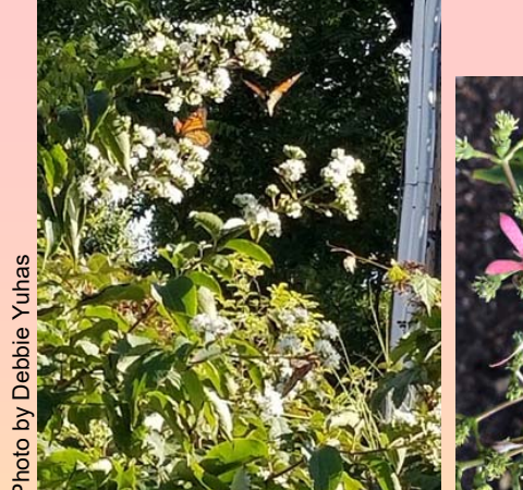
The Farmhouse Garden's 'Seven Son Flower Tree' flowered in September attracting Monarch butterflies and bees. This week, the showy bright red calyx have started to appear.