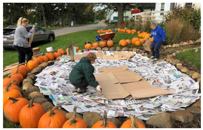
Smothering the Weeds and Adding Compost/Soil Mix to Begin Anew

organic matter that comprised the garden has subsided over the years creating more of a water collecting pocket than was desirable. Additionally, a few invasive plant species have insidiously crept into the garden. The renovation includes removing and potting or repurposing all of the plants in the rain garden, adding compost/soil mix to restore the desired garden soil level, removing undesirable plants and plant parts from the garden, and restoring a desirable plant mix to the garden. The rain garden is a great demonstration of a simple method that home owners and others can use to protect our surface and ground water. I appreciate all that Connie and others have done to bring it back to looking its best!