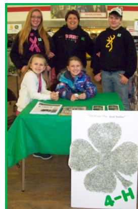
4-H members helping at the spring 2015 TSC campaign.