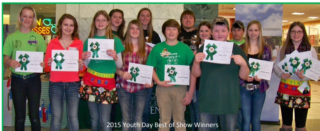
2015 Youth Day Best of Show Winners

For more information on Youth Day, such as project categories, contests and other activities please see pages 3-5 in this newsletter