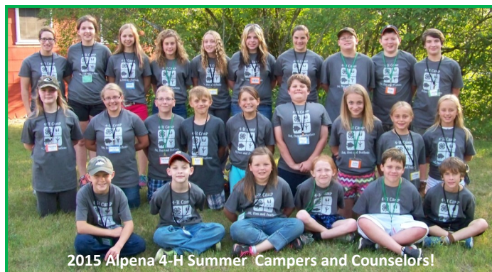
2015 Alpena 4-H Summer Campers and Counselors!