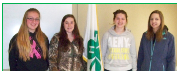
2015 Market Club Officers