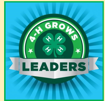
2016 Exploration Days Theme

July 30-August 7: 2016 Alpena County Fair Alpena County Fairgrounds