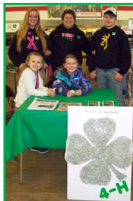
4-H members helping at the spring 2015 TSC campaign.