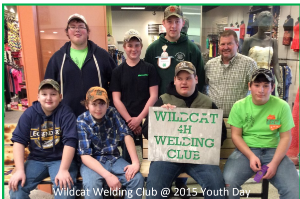
Wildcat Welding Club @ 2015 Youth Day