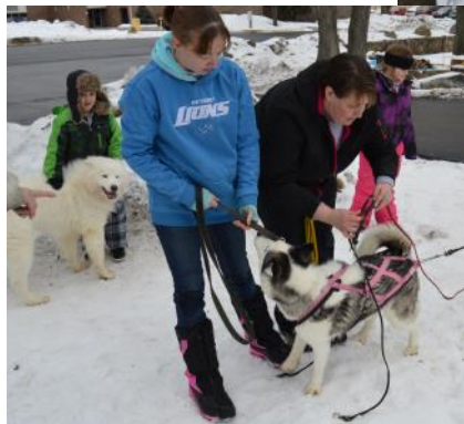
Winter Blast 2017