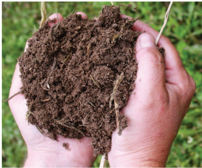
Fig. 1. Soil organic matter quality varies depending on plant inputs and management practices.

This bulletin describes the agronomic practices you can use to build SOM and the scientific underpinnings of those practices. We encourage farmers, farm advisors, agency personnel and other stakeholders to use the information presented here to improve their crop and soil management plans to increase SOM. Part of this effort should include on-farm experiments, which are an important step in adapting recommendations to specific regions and cropping systems.