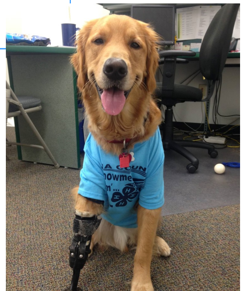
If you see this little guy at the fair, I am most likely not far behind.

Please let me know if you have questions on anything in the next couple of weeks, otherwise I will see you at the fair!