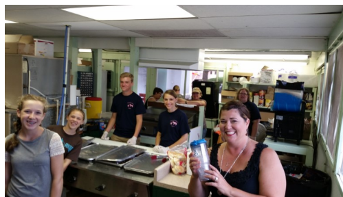
2016 4-H members working in the 4-H Service Club Food Booth.

If the 4-H member or family is involved in multiple clubs, it is expected that you work during each of your clubs' shifts, unless your leader tells you they don't need you during one. Parents are also asked to help during these shifts, especially when the club has many young members.