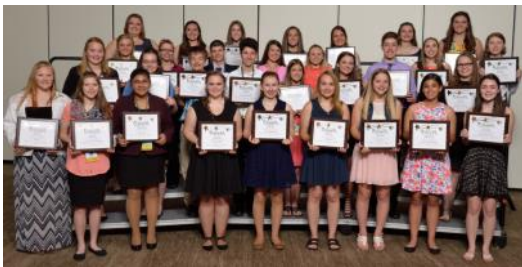
2017 State Award winners with their plaques at 4-H Exploration Days.

Michigan 4-H true leaders ages 11 and older have an opportunity to be recognized for the great work they do in 4-H by completing a state award application. A Michigan 4-H State Award is the highest honor bestowed on a Michigan 4-H member and provides an opportunity to receive recognition for their engagement in rich learning experiences that result in outstanding knowledge and life-skill development.