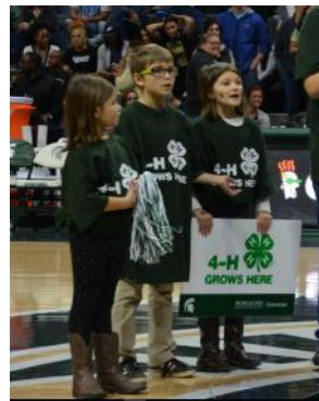
Michigan 4-Hers recite the American and 4-H pledges during the halftime show.

4-H alumni and their families are also invited to a special pre-event activity at Spartan Stadium, beginning at 1:30 p.m. To learn more, visit msue.anr.msu.edu/events/4_h_alumni_tip_off_reception .