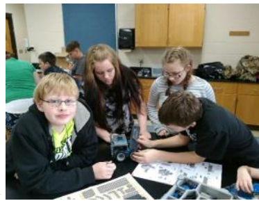
The 4-H After-School Robotics Club in Iosco County received a $1,000 Michigan 4-H Legacy Grant to use VEX Robotics as a tool to help club members develop life skills.