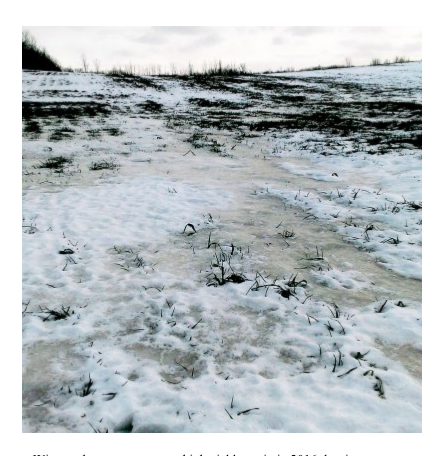
Winter wheat may generate high yields again in 2016 despite some challenging winter conditions. Note exposure on wind-swept knolls and pockets of ice.