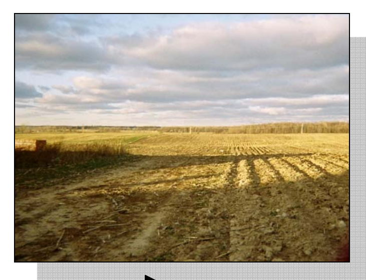
Agriculture is a key sector.

The community told the team that agriculture is an important part of the local economy. Some basic facts support the community's observations. In 2002, Tuscola County had 1,292 farms that generated $94 million in farm-level sales.<sup>‡</sup> Including the onfarm employment with the ethanol plant and sugar facilities, agriculture and agriculture-related industries are the No. 1 industry in the county. According to the Michigan Department of Agriculture, Tuscola County ranks second in the state in dry beans and sugar beet production. Tuscola County ranks third in the state in corn and wheat production, but the county lags its neighbors in livestock