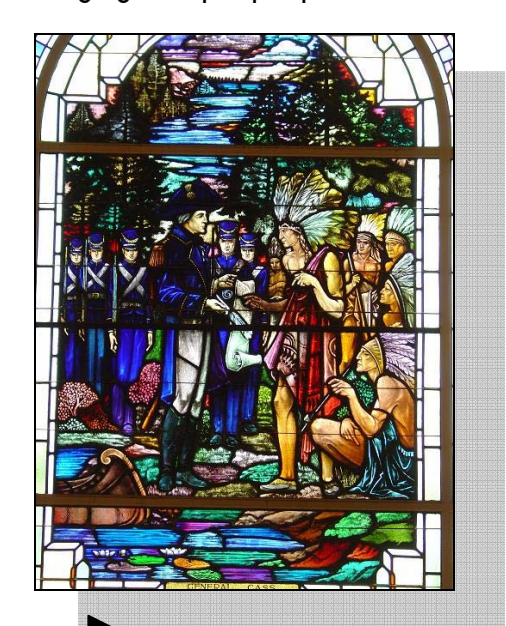
A time of change in Tuscola's history. More change is coming. The workforce must be ready.

Youth and education are closely aligned, but the scope and impact of education go well beyond youth. We no longer live in a world where the majority of people can stay in the same occupation for 30 to 40 years. The economy is constantly churning as old jobs are abandoned and new jobs are created. Even among those who are fortunate enough to find a satisfying occupation that has staying power, technology is constantly changing how people perform their work.