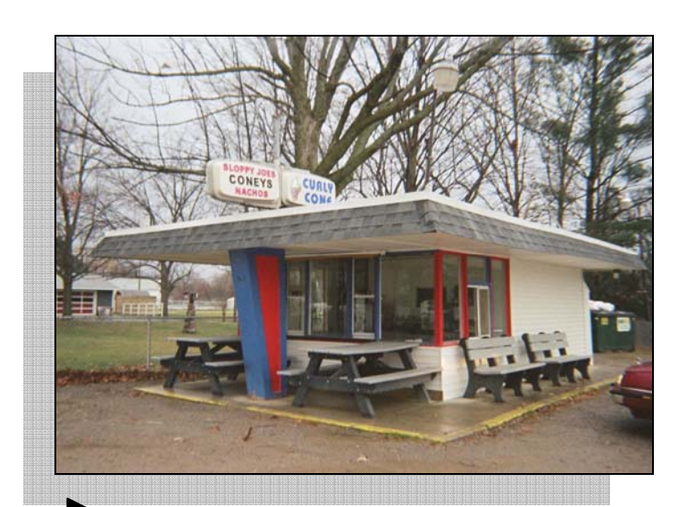
Where childhood memories are built.