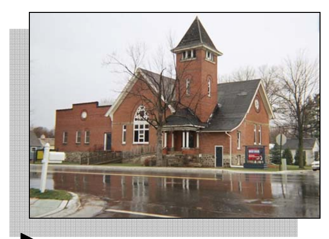
Area churches have positive models for youth engagement.