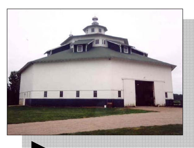
The Octagon Barn, an asset for cultural tourism development.

This section of the report will first discuss tourism development opportunities and then recreation. The two are related in that a strong recreational system can enhance tourism and vice versa. Tourism focuses on bringing people in from the outside. It also focuses on creating opportunities that keep people who would otherwise be tourists elsewhere enjoying themselves locally. Helping people to find local satisfaction instead of going elsewhere to enjoy themselves is a way of plugging economic leakages by encouraging recreation/tourism dollars to be locally spent. Recreation focuses on opportunities for people to enjoy themselves locally when they might just stay home otherwise.