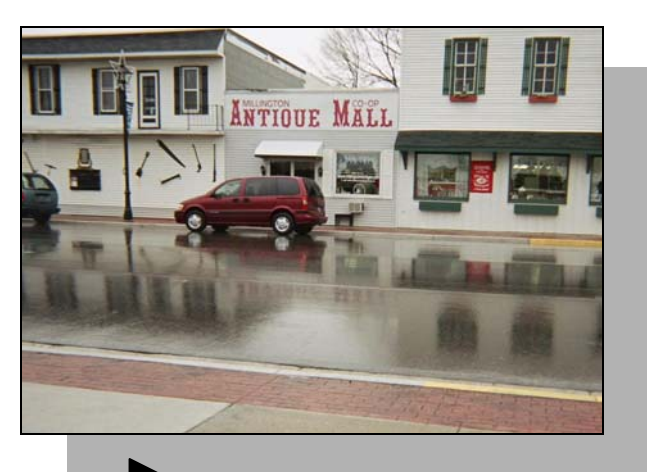
An example of effective reuse.

The full listing of community suggestions for facility reuse can be found in Appendix 6. Members of the community were asked whether it is better to hold storefronts for retail businesses or rent them, on a first-come, first-served basis, to other businesses, such as professional services firms. The team recommends renting vacant storefronts to professional service firms, when available, rather than maintaining an empty storefront. If demand for retail space grows in the future, rents will rise accordingly and professional offices will likely relocate to less central locations, creating space for retail establishments.