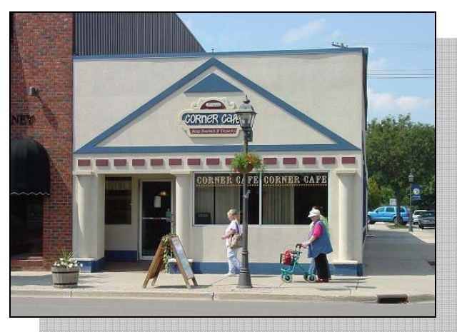
Creative use of a downtown asset.

The team also explored opportunities to enhance downtown vitality. Downtowns are considered the "face" of a community. It is important that downtowns convey a sense of vitality as part of a comprehensive economic development strategy. If a firm is considering relocating to Tuscola County, the condition of the downtown can influence that decision. In fact, some communities (e.g., Tecumseh) focus their economic development efforts in their downtown area.