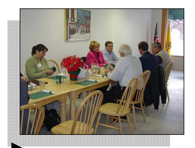
Team work session in Vassar.

sectors. The team noted a need for better communication and network building among educators, senior service providers, manufacturers and the retail/tourism/recreation/historic preservation sectors.