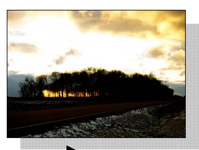
Looking to the future.

The team noted in several instances where new or strengthened local collaborative networks could help Tuscola adjust to changing circumstances and achieve goals. Networks of individuals with similar or complementary interests can help improve communications within the county, allowing it to seize opportunities or respond to crises as they arise. Within Tuscola County, a sector with a network that appears to be functioning at a high level is agriculture. The team was impressed with the vision, leadership and shared goals that members of this community articulated. The agricultural community could serve as a model for other