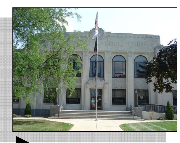
Education , economic development and government are linked.

On-the-job training can help meet some of the needs to keep pace with the changes in the workplace, but a strong local educational system sets the stage at the K-12 level by creating dynamic individuals who are flexible enough to adapt to the changing demands of the economy. Investments beyond high school are necessary to help people transition to completely new careers as new opportunities emerge or as individuals find their way in life. The quality of the local education system is definitely a consideration when businesses are choosing a new location. So education and economic development are linked in very important ways.