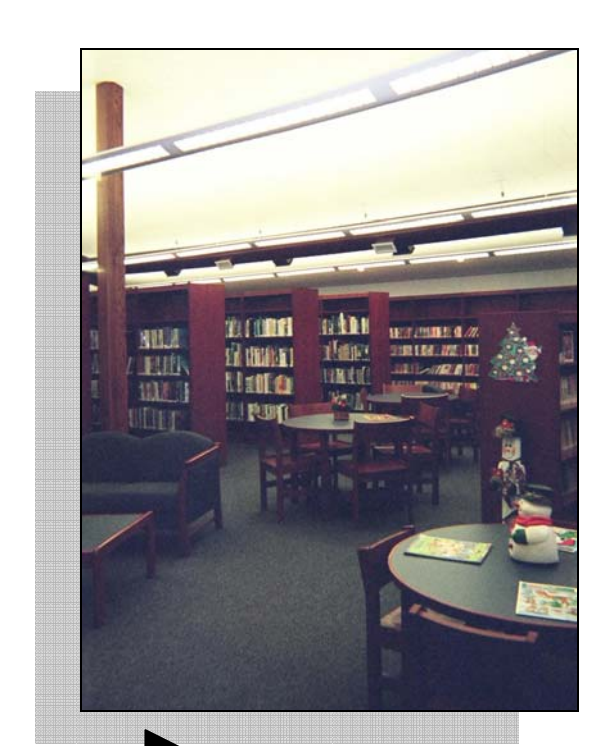
Youth are proud of their schools.

It is important to reflect on what the youth communicated about their community and focus on those things that are important to them. They are proud of their sports teams. Attention to their teams, with positive publicity and community support, will be noted by teens. The youth are proud of their churches and youth programs. Two church programs in particular seem to be doing a great job of connecting with youth. One is in Millington and the other is the Colwood Church. They draw literally hundreds of youth to their outreach programs with weekly open youthoriented programs. How do these churches get so many youth to participate? They offer contemporary programs that use music, technology, video games and the language of the youth. They have outreach workers who listen to youth. The CAT is not suggesting that programs have to be faith-based, but it is recommended that various youth-serving groups consider the models, the tools and the methods that these two churches are using