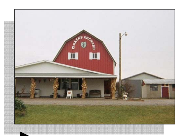
Direct-to-consumer marketing is a possible growth area.

http://web1.msue.msu.edu/wind/. A recently released map from the State Energy Office is accessible from that site and shows that Tuscola County is home to some of the best land-based wind sites in Michigan. Agricultural producers elsewhere have successfully formed new businesses to place new generation utilityscale windmills on their land and sell power to the grid. Rising energy prices, a new Michigan law that requires utility companies to buy wind power from their