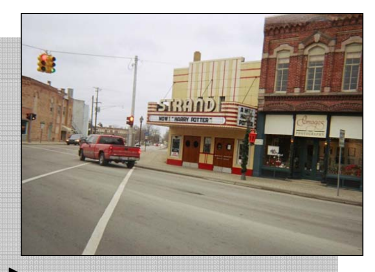
Older downtown buildings are resources.

changing community priorities. The community provided very positive suggestions for land use policy change in the CAT's open forum. The suggestions included updating ordinances and plans, adopting Smart Growth principles and pursuing mixed-use development (mixing retail and various housing types together). Mixed-use development can be very positive for seniors. Seniors like mixeduse housing because they don't have to travel as far to shop, eat or recreate. Managing growth proactively can lower costs of government infrastructure