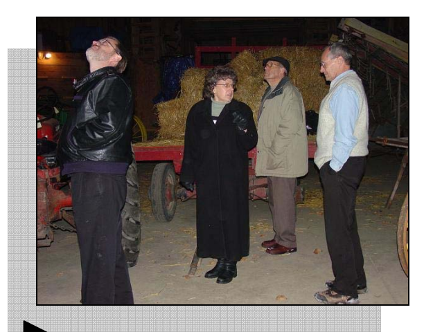
Team members inspect the inside of the Octagon Barn.

The team suggests an overarching principle for effective tourism development: build the community that local residents want. Don't reach for things that people think visitors might want. Find out what the people of Tuscola want. Tourism can be a good economic development strategy. If visitors see quality of life, they are more likely to come for repeat visits. Some may buy second homes in Tuscola. If they have second homes in Tuscola, they might retire or move their businesses here, providing additional economic development. Mississippi is focusing some economic development efforts on attracting people who are retired or are going to be retiring. It is a mistake to try to be all things to all people. If a business builds a