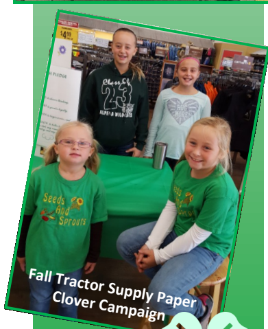
Fall Tractor Supply Paper Clover Campaign