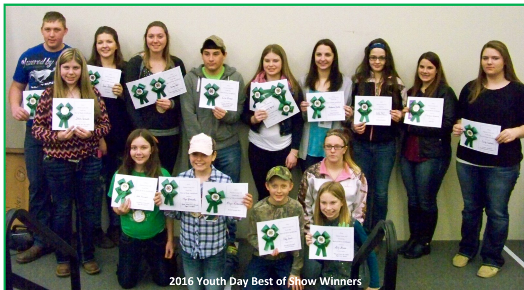
2016 Youth Day Best of Show Winners

Where: Thunder Bay Junior High School (3500 South 3rd Ave, Alpena)