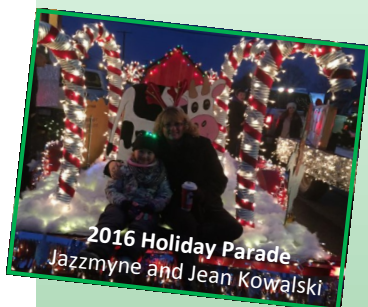
2016 Holiday Parade

The exception to this policy is for educational trainings and events that are part of the 4-H Shooting Sports program, which may use discipline specific firearms (BB, air pellet, .22, shotgun, muzzleloader & air pistol) for educational, demonstration and competition uses only and must comply with the policies and practices of the Michigan 4-H Shooting Sports program. This exception only applies during the period that the above-referenced firearms are in use for 4-H Shooting Sports educational, demonstration and competition purposes, and does not allow 4-H Shooting Sports volunteers to possess firearms for other purposes in conjunction with MSU Extension-sponsored programs."