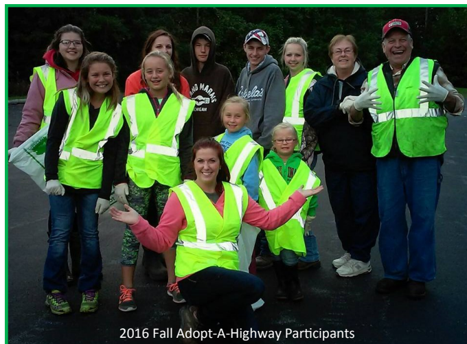
2016 Fall Adopt-A-Highway Participants

Please meet at the Long Rapids Hall at 5:45pm to kick off our 2017 spring Adopt-A-Highway clean-up! We will have a safety meeting, before dividing up into groups to clean our 2 mile stretch of M-65. The Alpena County 4-H Council will be providing pizza for dinner after the clean-up. We hope you're able to join us in giving back to our local community by volunteering!