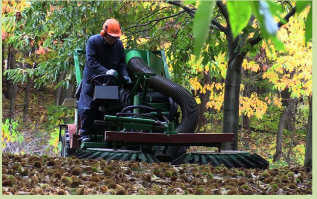
MSU Farm Manager Mario Mandujano tests the FACMA Cimini 180 chestnut harvester on a Michigan chestnut farm. A total of 8,000 pounds of nuts were harvested in a day and a half.

machine is that it not only picks up the nuts, but it separates the full nuts from the flat nuts, as well as the nuts from the burs and other debris. It will not open up closed burs, but if the bur is open and a nut or two are still inside, there is a good chance the nuts will fall from the bur. A two-person operation, debris cleaned from the nuts, flat nuts separated from full nuts, and a very fast harvest time. What more can you ask for?