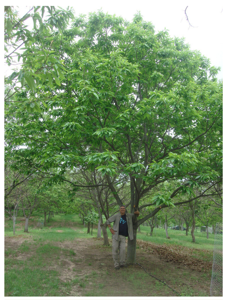
Figure 3: Pictured is Dr. Dennis Fulbright standing next to a 'Marigoule' tree in July 2014 in northern Michigan. Winter-damaged trees can be seen in the background and on the right side of the photo. No winter damage was observed in 'Marigoule'.