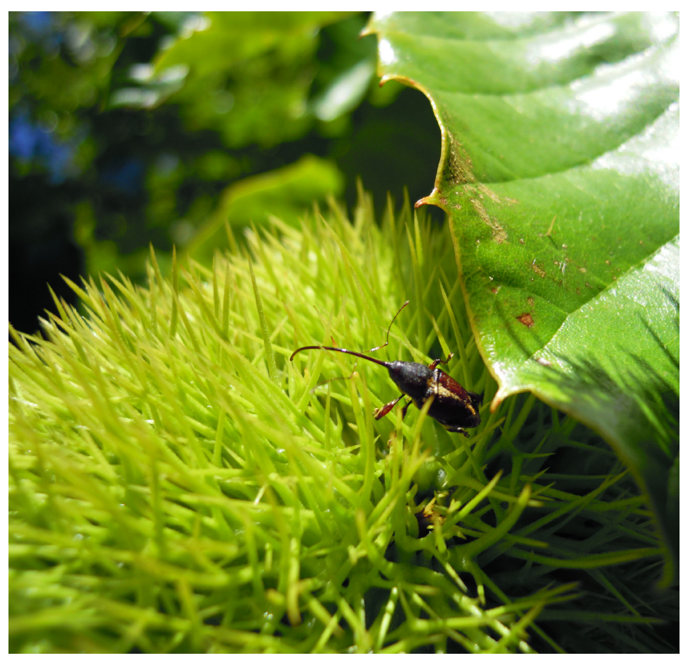
Larger chestnut weevil is 3/8-inch long, the snout is 3/8- to 5/8-inch long.

Lesser chestnut weevil adults likely emerge from the soil during two separate periods in Michigan, once in spring around bloom (May-June) and again in late summer and early fall just before burs open (September-October). Weevils that emerge in the