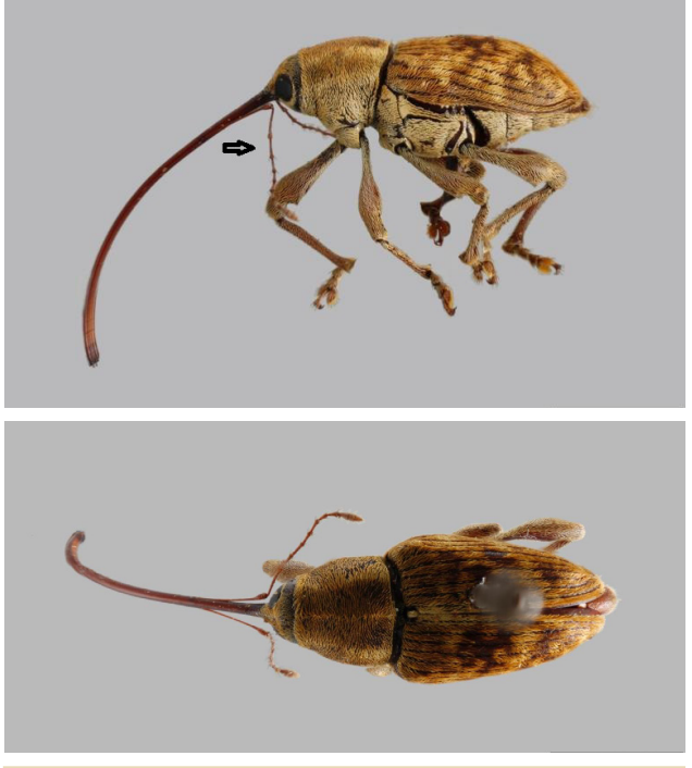
Lesser chestnut weevil are ¼-inch in length and appear orange to brown in color with a snout longer than the length of their body.