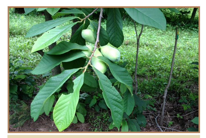
The MSU pawpaw research program was developed to identify successful practices for growing this specialty crop in Michigan. Conference attendees will learn more about the university's research program during educational sessions and field trips.

Both chestnuts and pawpaw have one thing in common: they don't store well for long periods of time compared to other nuts and fruit. They must be harvested, placed in