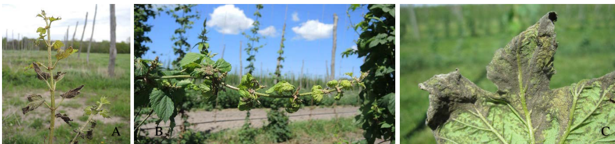
Picture A. Stunted downy mildew infected spike with sporulation. B. Downy mildew infected bine with cupped leaves failing to climb the string. C. Downy mildew sporulating on the underside of a leaf.

Scouting for downy mildew should begin when plants begin to grow and continue until the crop is dormant. Weekly scouting and monitoring is recommended and can help determine the level of disease that is present and whether current management practices are effective. Disease symptoms include stunted basal shoots that appear yellowish, bines that fail to climb the coir, brownish leaf lesions and terminal buds on sidearms. Disease signs include a gray to brown, fuzzy appearance on the underside of infected leaves due to the pathogen reproducing. Determine manageable parcels to monitor based on location, size and variety and scout these areas separately. It may be practical to monitor blocks that are 10 acres or smaller with plants of the same variety, age and spacing. Walk diagonally across the yard and along an edge row and change the path that is walked each time so as to inspect new areas. If downy mildew is observed, re-examine those specific areas each week.