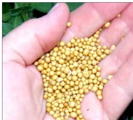
Peletized or slow release forms of fertilizer can be used easily and have a high level of protection from over-application.

As mentioned, nitrogen is mobile in the soil. It can also be volatile. Although fertilizers with slow-release nitrogen are more expensive than quick-release synthetic fertilizers, the benefits include low risk of burning the turf; more even, sustained grass growth (less mowing); and less leaching into ground and surface water. IBDU, methylene urea, sulfur-coated urea and polymer-coated urea are all forms of slowly soluble nitrogen. IBDU has low water solubility and is not affected by the activity of soil microbes, making it ideal for use on cool-season turfgrass. Sulfur-coated urea breaks down as water enters pores in the sulfur coating, causing the urea to slowly dissolve. Polymer-coated fertilizers release nitrogen as the plastic coating slowly dissolves. Urea-form fertilizers depend on long chain polymers to slow the release of nitrogen. You are more likely to find these types of slow-release fertilizers in products listed for professional use than in typical home lawn fertilizers.