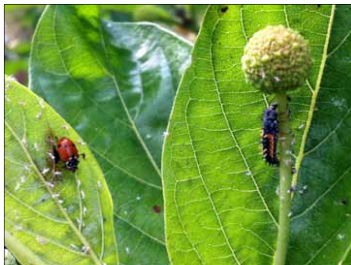
Adult lady beetle (left) and its larval stage (right) eating aphids on a button bush plant.

Other beneficials include the parasitoids; they will parasitize or feed off the pest insects. Examples include parasitic wasps that lay their eggs within the caterpillar or larval stage of pests; one such pest that is affected is the tomato or tobacco hornworm. If you see this big green caterpillar with many white protrusions on it, you are observing this natural process. A parasitic wasp has laid her eggs inside and they are developing on the paralyzed tomato hornworm, feeding off of it and eventually killing it. The offspring of the parasitic wasp will emerge from these white protrusions to begin the cycle over.