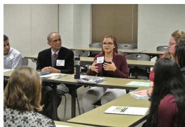
WFPMIYI empowers youth and gives them the opportunity to share their innovative ideas to better the world.

This life-changing experience offers the next generation of globally-minded leaders an opportunity to address international challenges through the investigation of new technology, potential academic pursuits, and future careers that will impact food insecurity across the world.