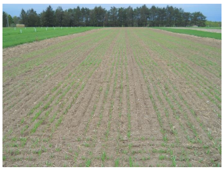
Figure 1: Planting barley variety plots (left) at the MSU Upper Peninsula Research and Extension Center on May 14, 2013 in Chatham, MI. Plots emerged (right), photo May 28, 2013.