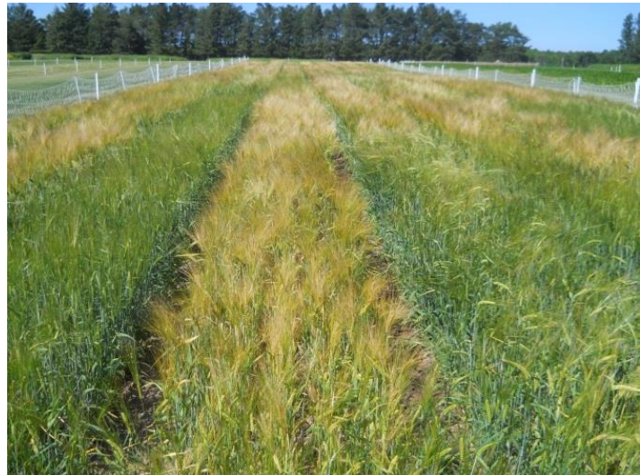
Figure 2: Plots on July 2, 2013 (left) and August 2, 2013 (right)