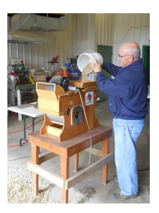
Figure 4: Plot harvest (9/13/13) and seed cleaning/processing (9/18/13)