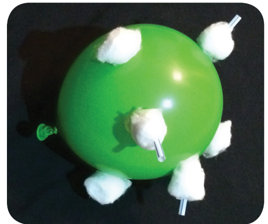
Model of Virus