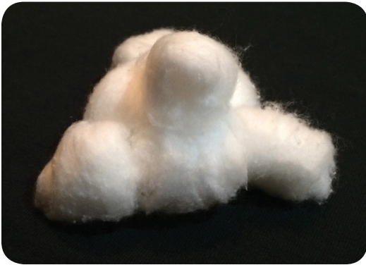
Model of Zoonotic Bacteria – Cocci

If we take a look at our bacteria, we see they are log or “rod” shaped. When we split them in half we demonstrated how they reproduce – they create a copy of themselves. The shortest pipe cleaners represent “pili,” small hair-like extensions that help bacteria adhere to cells. The longer pipe cleaner pieces represent “flagella,” which help bacteria to move. Not all rod-shaped bacteria have pili or flagella, but some have pili or flagella, or both. Examples of rod-shaped bacteria are Salmonella and E.Coli. We have successfully made our first type of bacteria.