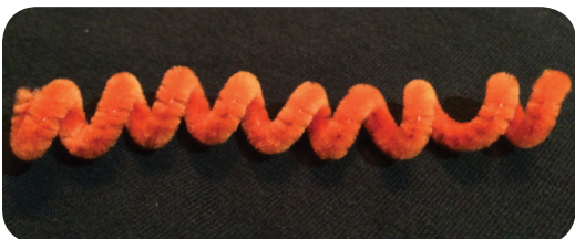
Model of Zoonotic Bacteria – Spirochete

We will now make what is called a spirochete bacterium. Take the single full-length pipe cleaner and wrap it around the pencil (or the similar-shaped object that you gave them). Then slide the pipe cleaner off of the object. (See photo left.) This represents a spirochete bacterium. It is long, can coil and tends to be flexible. This is another commonly found shape of bacteria. Borrelia burgdorferi is one of the largest concerns as it causes Lyme disease.