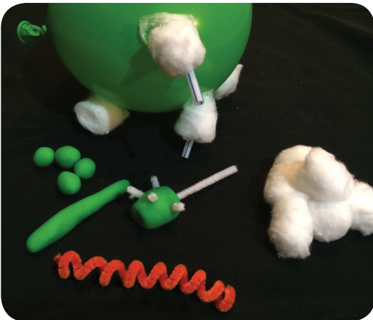
Models of the Three Main Pathogen Types (Bacteria, Viruses and Parasites)