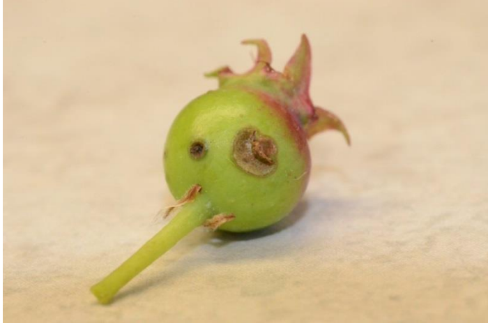
Curculio feeding and egg laying scars.

Injuries left to right, leaf-roller curculio feeding, egg laying-curculio feeding .