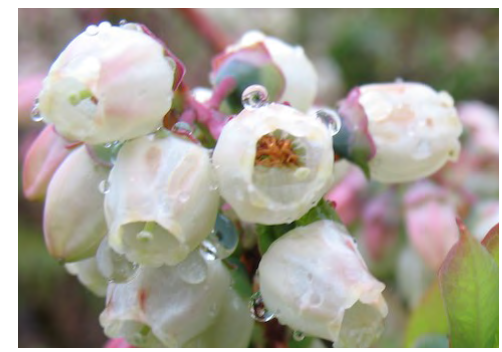
Blueray at full bloom in Holland