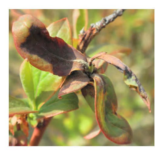
Fig 1. Shoot strike symptoms observed near Grand Junction on 10 May 2010; Photo: T. Miles.

Gray sporulation was particularly visible on the older shoot strikes at the West Olive site this week, probably due to the precipitation over the weekend.