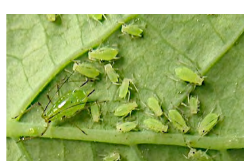
Fig 3. Aphid colony on the underside of a leaf; Photo: K. Mason.

To scout for aphids, examine the underside of leaves on two young shoots near the crown on each of 10 bushes and record the number of shoots where aphids are found. Also record the number of shoots with parasitized aphids. Be sure to sample weekly from as wide an area in the field as possible to have a better chance of detecting whether aphids are present. Although natural enemies (parasitic wasps, lady beetles, lacewings, hover fly larvae) can