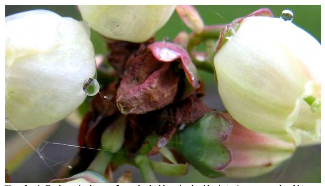
Fig 2. Leafroller larva feeding on flower buds. Note the dead buds in the center and webbing around the cluster; Photo: K. Mason.

keep this pest in check, aphids can transmit blueberry shoestring virus, so growers may want to consider using an insecticide to control aphids if they have blueberry varieties susceptible to shoestring on their farm.