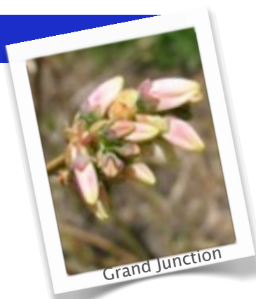
Van Buren County Jersey in Covert and Blueray in Grand Junction are at pink bud, and Bluecrop in Grand Junction is at late pink.