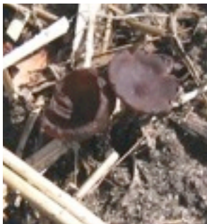
Fig 4. Apothecium with a cup size of 1/3 of an inch (9 mm) observed in Grand Junction, MI on 5-3-09.