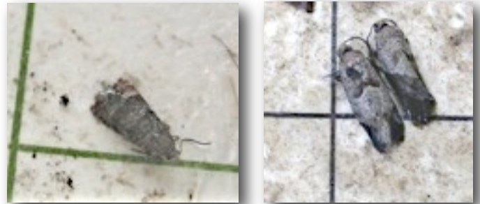
Fig 3. Cherry fruit worm (left) and the ‘contaminant moth’ found in cherry fruitworm traps (right).

The numbers of “contaminant” moths in cherry fruitworm traps has declined sharply, and we expect these numbers to continue to decrease over the next two weeks. See Fig. 3 for pictures of the contaminant moth and cherry fruitworm.