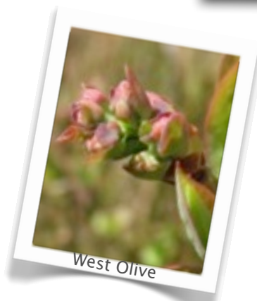
Ottawa County Blueray in Holland, and Rubel and Bluecrop in West Olive are at pink bud.