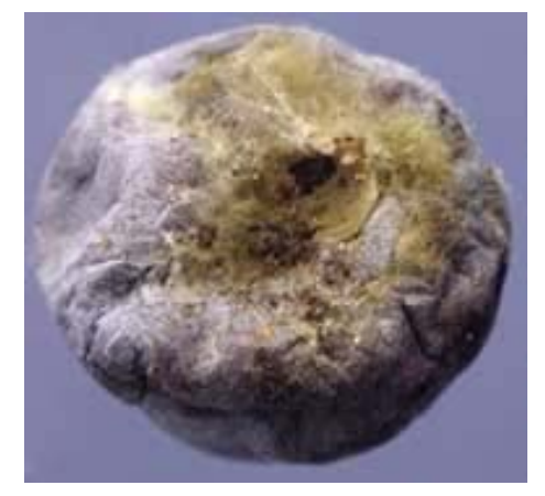
Figure 3. Post-harvest incubation of fruit under high humidity results in a fuzzy grayish green mold to form on the fruit surface.

Cultural control measures are also extremely effective and should be aimed at making the environment less conducive for pathogen growth and development, e.g., by pruning bushes to create an open canopy (this will also allow better spray penetration), good weed control, and timing of overhead irrigation to allow rapid drying of leaves and fruit. Timely harvests and rapid cooling and processing of fruit can reduce post-harvest losses. In the long term, pruning out of old or infected canes and twigs can be effective at eradicating or reducing overwintering inoculum. Another option is to plant resistant cultivars, such as Elliott. Among the newer cultivars, Draper and Aurora are also resistant to Alternaria fruit rot.