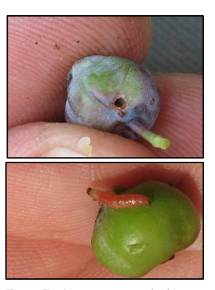
Top: Fruitworm entry hole. Note the characteristic darkening of the fruit. Bottom: Cherry fruitworm larva.

Cranberry fruitworm moth flight appears to be past its peak in both Van Buren and Ottawa Counties. A single cherry fruitworm moth was caught in Holland. Cranberry fruitworm eggs were observed in Covert and Holland, but no cherry fruitworm eggs were found. The amount of single berry damage has increased at the Covert, Grand Junction and Holland farms. This damage (example on the right) can be from cherry fruitworm, or it could be early feeding damage from cranberry fruitworm. Live cherry fruitworm larvae were seen at all farms with damaged berries. Low amounts of multiple berry damage, caused by progressing cranberry fruitworm feeding, was seen at Covert, Grand Junction and Holland. In the next week, we expect to see an increase in fruit with signs of fruitworm feeding damage. If either of these insects have been trapped, or if you are seeing damage from these pests on your farm, you will likely need to apply insecticides for fruitworm control. See the past newsletter page for the 4 June 2007 article on post-bloom fruitworm management for some insecticide options.