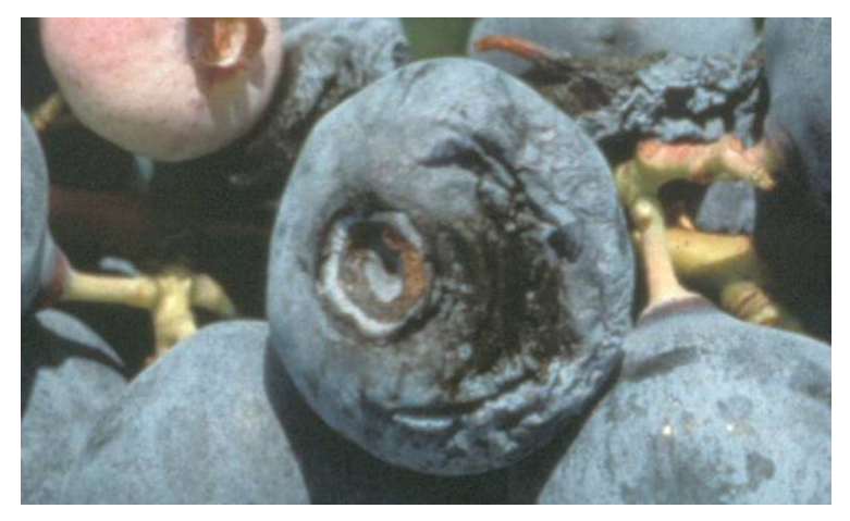
Figure 2. Alternaria fruit rot symptoms seen prior to harvest. Notice the dark-green or blackish spores on the sunken lesion.

Alternaria overwinters in infected canes, old twigs and in plant debris on the ground. Studies have also demonstrated that alternaria has a variety of alternate host that can serve as a source of inoculum for more fruit infections. In North Carolina, leaf infections occur in the spring during periods of cool, wet weather, and can serve as a vector for fruit infections in the summer. Fruit infections occur as berries start to ripen.