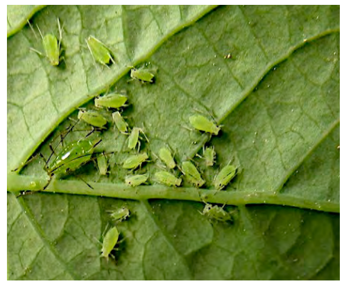
Fig 2. Search for aphid colonies on the underside of leaves on young shoots; Photo: K. Mason .

Growers and scouts should hang blueberry maggot traps in the next week