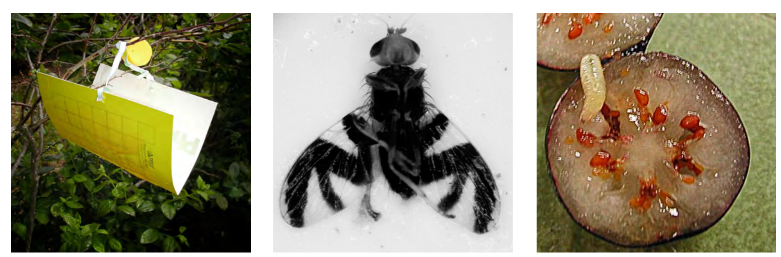
Fig 3. Left to right: Monitoring trap with V-orientation for monitoring blueberry maggot, fly on trap with distinctive wing pattern, maggot on ripe blueberry; Photos: R. Isaacs.

Control of blueberry maggot has been achieved for many years using broad spectrum insecticides. These kill the adult fly on contact and prevent the insect surviving to the point of being able to lay eggs into the fruit. The organophosphates Guthion, Malathion and Imidan are highly active on blueberry maggot, with the latter two products having shorter pre-harvest intervals and potential for use closer to harvest. Note that there is a 1.5 pound per acre limit on Guthion this season. Carbamates such as Sevin and Lannate and the pyrethroids Asana, Mustang Max, Bifenture and Danitol are also active on adult fruit flies. As a general rule, our trials in fruit crops against maggot flies have shown lower activity from the pyrethroid chemical class than from the organophosphates. This chemical class is sensitive to