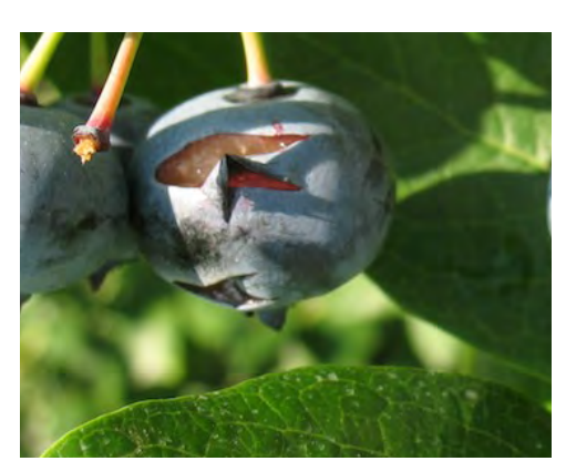
Fig 2. Bird feeding damage.

monitoring will aid growers and scouts in timing control measures to keep fields clean of Japanese beetles before harvest, and reduce the possibility of contamination during picking.