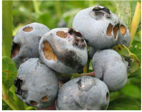
Fig 1. Japanese beetle feeding damage

on the field border and 10 bushes in the field interior and record the number of beetles on each bush. Keep in mind Japanese beetles are normally more common adjacent to grassy areas on sandy soils, and they prefer to be in sunny areas. Be sure to check any fiveleaf ivy, wild grape or sassafras growing in fields as these plants are very attractive to Japanese beetles. Regular