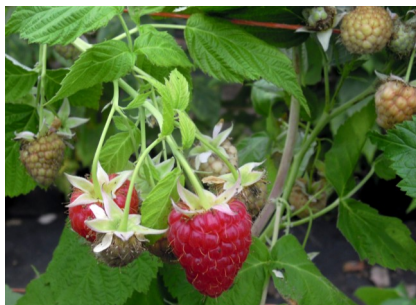
Fig. 8 Joan J' raspberries

JOAN IRENE . England. 2007. (Joan J X numbered selection). This variety is new to North America and appears to mature very late; 1-2 weeks after Heritage. Fruit are large, conical shaped, darker red in color (lighter than Joan J), and flavorful. Based on observations in pot culture under a high tunnel in southwest Michigan, Joan Irene is too late for field production in Michigan. Some late leaf rust appeared on foliage but not fruit in late September. Berries sometimes adhere tightly and are difficult to pick.