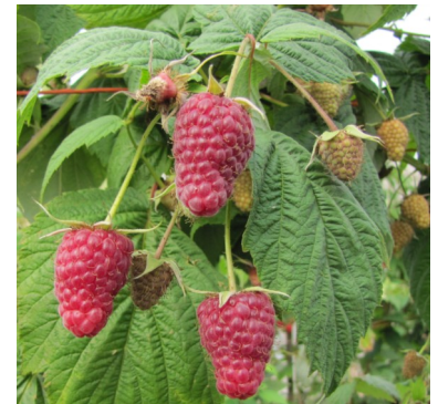
Fig. 7 'Jaclyn' raspberries