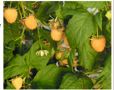
Fig. 3 'Anne' fall raspberry

ANNE New Jersey/Maryland, 1998 (Amity X Glen Garry). Anne matures 7 to 10 days before Heritage. Yield potential is high and berries are large and easily removed. Flavor is quite different and more delicate than red raspberries, but most people rate it as good to excellent. Plants have medium vigor and produce fewer canes than most varieties. Anne appears to be the best yellow fruited variety for Michigan. When grown in pots in a south-west MI high tunnel, Anne had relatively high levels of gray mold.