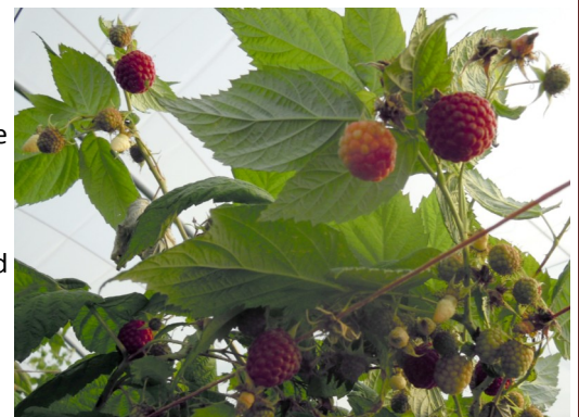
Fig 5. 'Crimson Giant' raspberry

CAROLINE New Jersey/Maryland, 1998 (Autumn Bliss X Glen Moy). Caroline is a popular early mid-season variety in the Midwest. Berries are medium to large, with a medium red color and excellent flavor. Yields in tunnels and open fields are very high. Fruit are tolerant to gray mold, slightly soft and best suited for direct marketing. Plants produce abundant, vigorous canes and are tolerant of Phytophthora root rot. Fruit size may decline as plants get older.