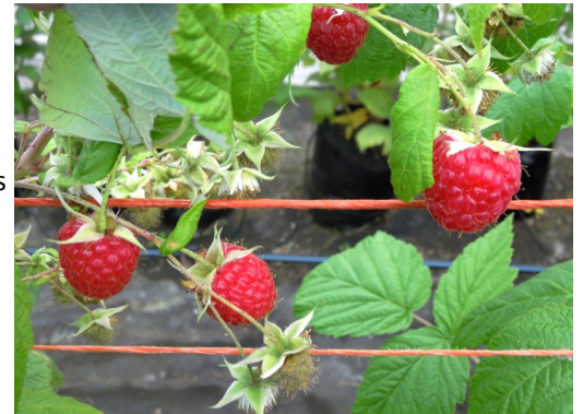
Fig. 6 'Himbo Top' raspberries

NANTAHALA North Carolina. 2010. (NC 245 (AlgonquinxRoyalty) X Rossana). Nantahala is late ripening (about a week after Heritage), but fruit are very large and light red in color with an excellent flavor. Canes are vigorous and thorny. This variety has only been observed in pot culture under tunnels in southwest Michigan. Fruit quality is excellent, but harvest time is likely too late