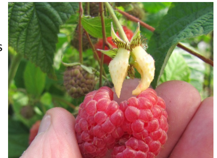
Fig. 1 Double berry on 'Encore' in high tunnel pot culture

PRELUDE New York 1998 (Durham X September). This very early season variety is commonly used in Michigan and other areas of the Midwest for reliable yields, hardiness and good quality. Fruit are