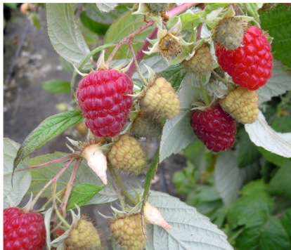
Fig. 4 'Caroline' raspberry

AUTUMN BRITTEN England, 1995 (sibling of Autumn Bliss). This variety matures about the same time as Autumn Bliss (2-3 weeks before Heritage), but fruit quality is better. Berries are large, medium to darker red, and more firm and flavorful than Bliss. Berries are prone to gray mold. Cane vigor and number are low to average. Yields are low to average. Autumn Britten has been grown successfully in high tunnels. Autumn Britten produced a high percentage of double berries during the hot 2012 season in the potted raspberry high tunnel trial.