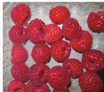
Fig 2. fruits of 'Nova' raspberry

LATHAM Minnesota 1914 (King X Loudon). This midseason variety had been popular in colder areas of the Midwest for many years due to its high vigor, reliable yields and extreme hardiness. Berry quality is only fair though. They tend to be medium in size, darker red, and can become soft and crumbly. Plants have Phytophthora root rot tolerance and canes are nearly thornless. Varieties with better fruit quality than Latham are now available.