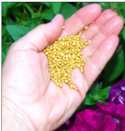
Pelleted or slow release forms of fertilizer can be used easily and have a high level of safety from over-application.

Deciding what type of fertilizer to buy can be confusing, but choosing the right one will help ensure successful plant growth. In general, there are two classes of products available to home gardeners: naturally derived and synthetic. Naturally derived (sometimes called natural organic) and synthetic fertilizers have different characteristics, variability in cost and availability to the plant.