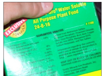
Soluble fertilizers are sold in either solid form or as a liquid. Both are intended to be diluted with water according to the label.

The term organic as defined by a chemist versus a home gardener may not be the same thing. Organic compounds contain the element carbon, which would represent naturally derived sources of fertilizer as well as urea, a synthetically derived fertilizer. Generally speaking, products that are composed of organic matter such as