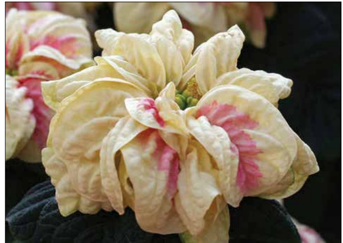
Leaves curl on this cultivar, 'Winter Rose.'

are already in a sleeve or displayed in a crowded manner. Avoid wilted plants, even though the media is moist. Protect plants from cold wind (temperatures colder than 50°F) with a sleeve. Carefully unwrap the poinsettia when you get it home.