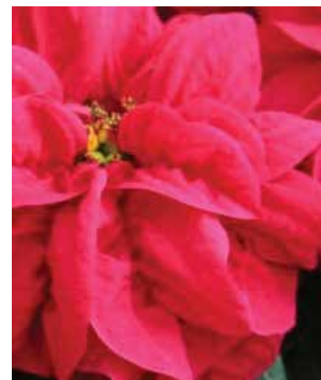
Above, a blue poinsettia. At right, 'Peppermint Twist.' Below, 'Holly Point.'