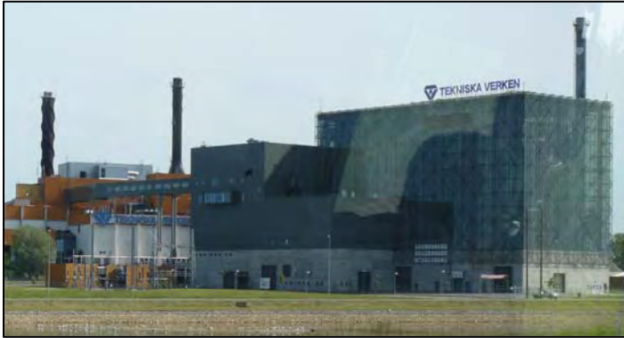
CHP plant with electric capacity of 19 MW and heat capacity of 83 MW.

A C ombined H eat and P ower (CHP) plant processes heating, cooling, and electricity from a feedstock such as coal, biomass, etc. An alternative definition is C ooling, H eating, and P ower. Conventional power plants typically utilize feedstocks for electricity generation alone. The boilers that turn the electricity-generating turbines produce a lot of heat, but that heat energy is typically vented up the smokestacks. Since 1960, the average efficiency of conventional power plants has run about 33 percent. 1 Of course, technology upgrades can increase the efficiency of coal-fired power plants.