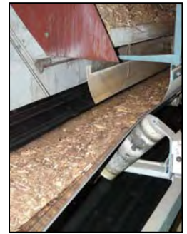
Woody feedstock supply conveyor into a biomass powered CHP plant.

CHP plants that use biomass feedstocks can sell carbon credits or “green” credits in financial markets where such systems are developed. These credits can be an additional and important revenue stream for the energy company. In states with renewable energy portfolios, electric utilities are required to produce a percentage of their power from “green” sources. For states that define wood as a “green” energy source, wood can be an excellent sustainable and environmentally-friendly feedstock.