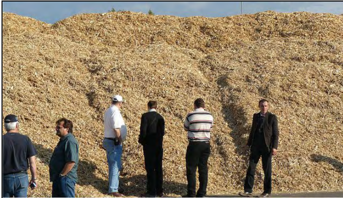
Shredded wood used to supply a small district heating plant.

The heating plant can be configured to use woody biomass as a feedstock (chips, shavings, pellets, etc.). Various configurations can utilize different combinations of renewable feedstocks, as well as traditional fossil fuels.