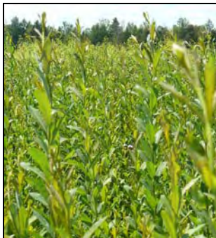
Willow genetics trial at the MSU Upper Peninsula Tree Improvement Center.

In the past, District Energy was used to help maintain snow-free and ice-free conditions on sidewalks and public areas, as well as for building heat. In the near future, District Energy may be an economical option to provide renewable, sustainable, and clean heat (and cooling) for business, government, and residential buildings. In some countries, a large and increasing portion of heating energy already comes from woody biomass.