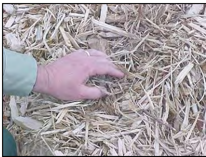
Shredded bark and wood.

Most of the soil nutrient and water cycles would be largely unaffected by biomass harvesting, except for some short-term disturbances. 1 Effects vary widely and are site-specific. Of course, certain soil types, such as infertile sands, would likely sustain certain loss, such as calcium, if harvesting occurred too frequently. Energy plantations would be higher risk on these soils, but plantations are unlikely to be established on these kinds of soils. Adhering to biomass harvesting guidelines would minimize or eliminate risks. The majority of our forest land should be able to support sustainable harvest levels of both timber products and biomass for energy.