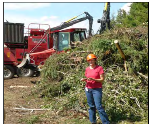
Slash to be processed at a log landing.

The largest pool of woody biomass comes from annual forest growth. Michigan forests have experienced some of the greatest net growth volume accumulations in the nation. 2 Our forests could contribute vast amounts of woody biomass in a sustainable manner. Even if we capture 25 percent of that annual growth, significant inroads will be made into reducing fossil fuel consumption and building a more sustainable energy economy.