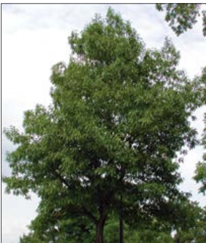
Joseph O'Brien, Bugwood.org

Pests: Oak wilt, chestnut blight, shoestring root rot, anthracnose, oak leaf blister, cankers, leaf spots and powdery mildew. Potential insect pests include scales, oak skeletonizers, leafminers, galls, oak lace bugs, borers, caterpillars and nut weevils.