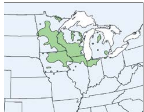
U.S. Geological Survey