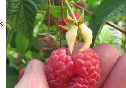
Fig. 1 Double berry on 'Encore' in high tunnel pot culture

HAIDA Vancouver, BC, 1973 (Malling Promise X Creston) is a late midseason variety that has been grown to some extend in the Midwest, although it is just marginally hardy for colder sites. Fruit are, medium to large with good firmness, and are suited for fresh and processed uses. Plants produce numerous spiny, upright canes and have resistance to raspberry aphid and spur blight.