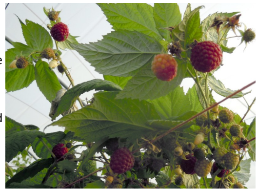
Fig 5. 'Crimson Giant' raspberry

CRIMSON GIANT New York 2012 (Titan X NY950). This new variety was introduced for very late fall production (appears to be 2 weeks later than Heritage), and may be too late for open field production in Michigan. Fruit have a mild flavor, are blunt conical in shape, very large, and do not hold their shape well. Canes are very vigorous, thorny and stout. In pot culture in a high tunnel in southern Michigan, berries have been very large, but flavor ratings were low. Fruit are also susceptible to Botrytis gray mold.