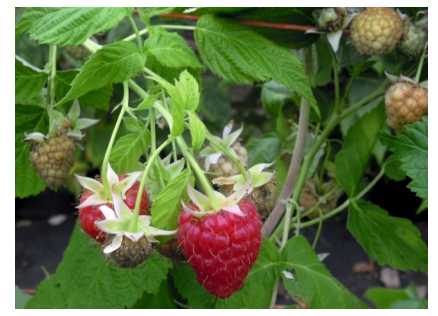
Fig. 8 Joan J' raspberries

JOAN IRENE . England. 2007. (Joan J X numbered selection). This variety is new to North America and appears to mature very late; 1-2 weeks after Heritage. Fruit are large, conical shaped, darker red in color (lighter than Joan J), and flavorful. Based on observations in pot culture under a high tunnel in southwest Michigan, Joan Irene is too late for field production in Michigan. Some late leaf rust appeared on foliage but not fruit in late September. Berries sometimes adhere tightly and are difficult to pick.