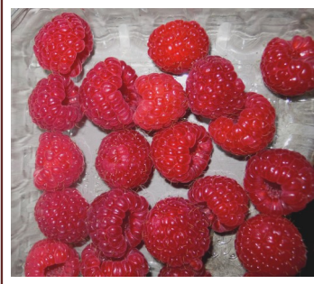
Fig 2. fruits of 'Nova' raspberry

LATHAM Minnesota 1914 (King X Louden). This midseason variety had been popular in colder areas of the Midwest for many years due to its high vigor, reliable yields and extreme hardiness. Berry quality is only fair though. They tend to be medium in size, darker red, and can become soft and crumbly. Plants have Phytophthora root rot tolerance and canes are nearly thornless. Varieties with better fruit quality than Latham are now available.