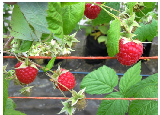
Fig. 6 'Himbo Top' raspberries

ERIKA Italy. 2002 (open pollinated Autumn Bliss). This is a proprietary variety (not currently available to the public) that reportedly produces large, lighter red berries. Harvest is very late; about a week after Heritage. Canes are thorny. Erika is being tested in pots under high tunnels in southwest MI. Berries were bright red, moderately firm, and had very nice flavor. Powdery mildew was moderate on this cultivar in fall of 2012 in the high tunnel trial.