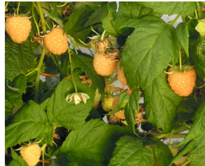
Fig. 3 'Anne' fall raspberry

AUTUMN BLISS England, 1984. This early maturing variety (2-3 weeks before Heritage) has become less popular as newer early varieties are available. Fruit are large with a pleasant mild flavor, but they are very susceptible to gray mold, somewhat soft, and have a tendency to be crumbly. Plants produce relatively few canes that are medium in height.