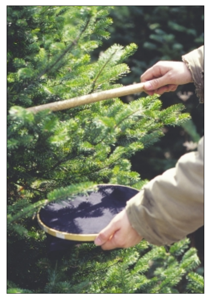
Figure 10. Use an embroidery hoop with black cloth and a dowel to sample aphids.

Conservation biological control refers to practices that conserve, protect or enhance populations of natural enemies. Many of these practices can be readily implemented and will be cost-effective in any Christmas tree field. Insect predators that feed on balsam twig aphid (see above) can be a key factor in maintaining aphid populations at low, non-damaging densities. You can conserve these predators by limiting application of broadspectrum insecticides and using selective products when they are available. For example, spruce spider mites are a common pest problem on fir Christmas trees. One product called Savey<sup>®</sup> 50 DF (active ingredient hexythyiazox) will provide effective control of spruce spider mites but will not