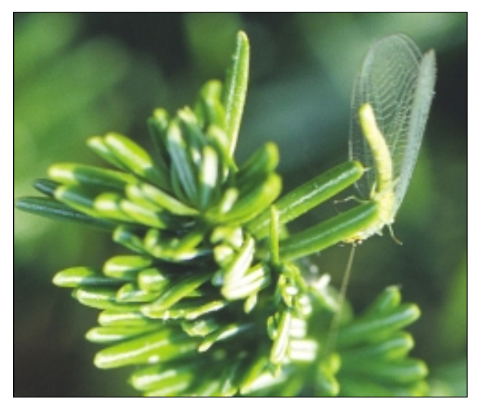
Figure 8b. Green lacewing adult.