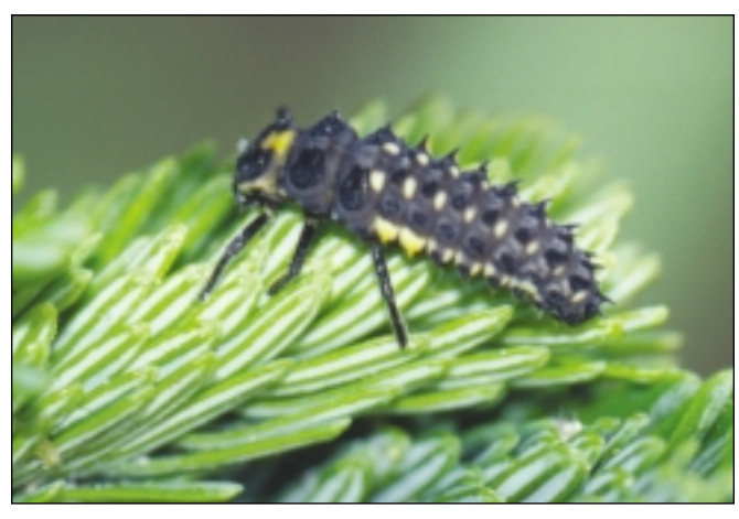
Figure 9c. Ladybird beetle larvae are important predators of balsam twig aphid.