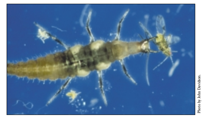
Figure 8a. Larvae of green lacewings prey primarily on aphids.