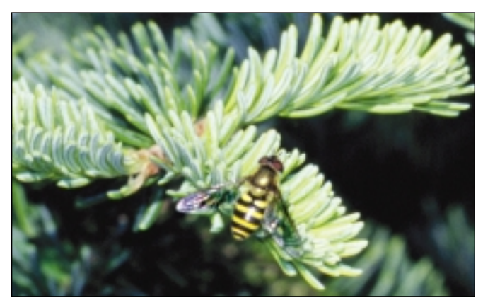
Figure 6b. Syrphid fly adult.