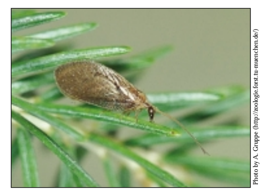
Figure 7. Brown lacewing adult.

are difficult to see, but they actively hunt for aphids in the buds and shoots. Adults can be observed preying on aphids or laying eggs once temperatures warm up in the spring. They often "play dead" when disturbed.