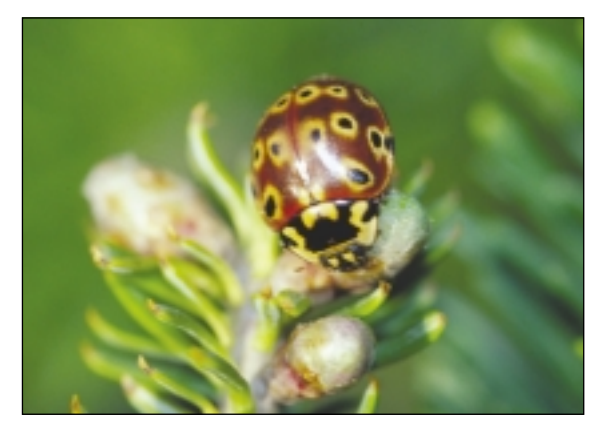
Figure 9b. Anatis mali, the largest native ladybird beetle, begins feeding on aphids in early spring.

Scouting: Effectively managing balsam twig aphid requires early-season scouting and decision making. One of the first steps in managing balsam twig aphid is to evaluate the amount of damage from the previous year. This can be done in late autumn or in early spring. Walk diagonal transects that zigzag through your field. Check mid- and lower canopies, as well as the upper canopy, for damage. If you find little or no aphid damage, treatment is unlikely to be needed this year. When you observe damage, make notes or draw a map of affected areas so that you can prioritize them for future monitoring or control activities.