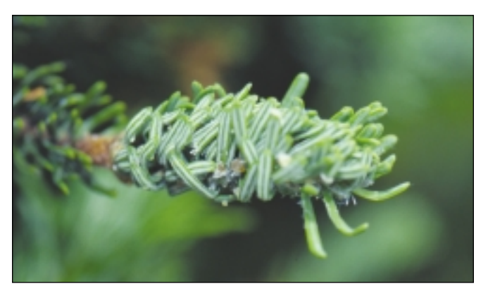
Figure 3. Aphid feeding causes needles to curl tightly.

Feeding by the second generation of aphids (the sexuparae) in the swelling buds and expanding needles can affect the growth and appearance of trees. At low aphid densities, some needles on infested shoots will bend or curl slightly, but this rarely causes noticeable damage (Fig. 4). When aphid densities are high, however, current-year needles become distorted and appear to be curled or wrapped around the shoot (Fig. 5). When this level of damage occurs, needle growth may be reduced, causing the currentyear shoots to appear stunted. If heavy feeding occurs in consecutive years, tree vigor and growth rates may decline. Balsam twig aphid rarely kills trees, but reduced tree growth and appearance can decrease tree value and reduce profits for growers.