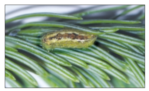
Figure 6a. Syrphid fly larva.

Brown lacewings (Fig. 7) are predators of aphids as both adults and larvae. Brown lacewing adults overwinter in the litter layer, emerge early in spring and lay eggs that will hatch about a month later. The small brown lacewing larvae