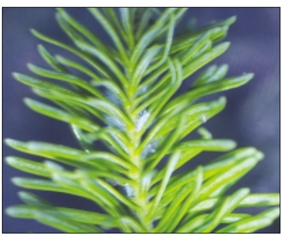
Figure 4. Light damage caused by low to moderate aphid populations.