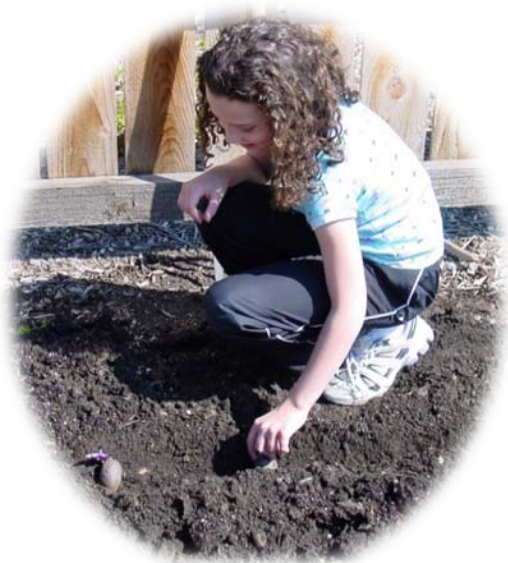
Figure 6: Plant seed pieces 3 to 4 inches deep and space 9 to 12 inches apart.

Potatoes are a cool season crop; ideal temperatures for crop growth are 65 to 80 during the day and 55 to 65 at night. The soil should be cultivated 6 to 8 inches deep in the spring, and large soil clods should be broken up or removed before planting. Plant potatoes when soil temperatures are above 45 F. Cold, wet soil at planting time increases the risk of seed piece decay, and planting into cool, dry soils can cause delayed sprouting and emergence of the potatoes.