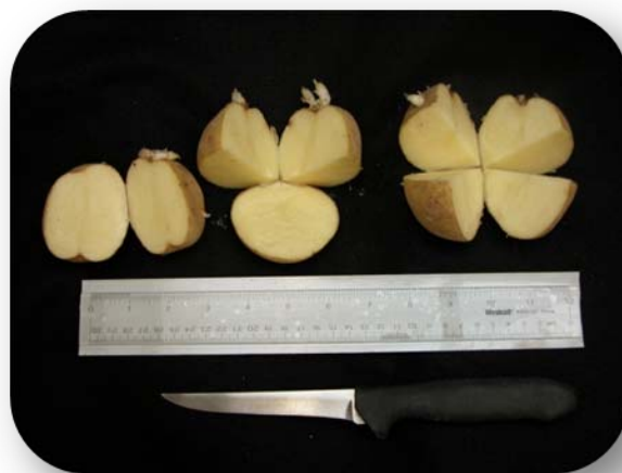
Figure 5: Tuber seed piece cuttings.

per section and a maximum sprout length of 1/4 to 1/2 inch to ensure optimum germination. Seed tubers can be cut and planted on the same day, however allowing the cut surface to heal over for 4-7 days may reduce the risk of seed pieces rotting in the soil.