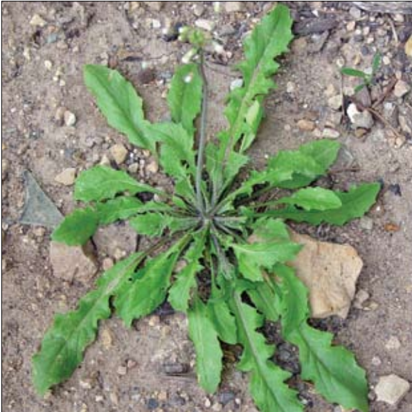
Shepherd's purse rosette.

Leaves initially develop from a basal rosette. Basal leaves are stalked and highly variable in shape; young leaves are first rounded and elongated, becoming variously lobed, toothed or wavy. Smaller stem leaves are alternate with smooth to toothed margins and clasping bases.