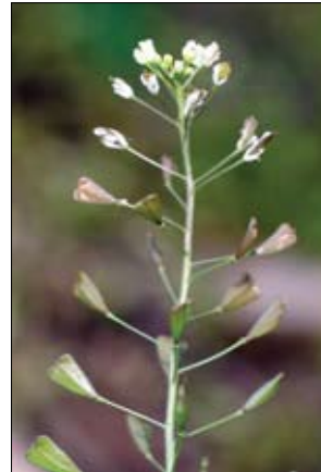
Shepherd's purse flowering cluster.