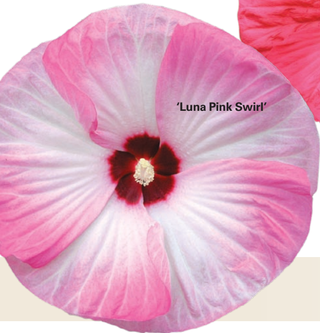
'Luna Pink Swirl'