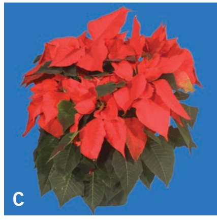
Figure 1. Examples of quality ratings: A) Quality rating = 10; B) Quality rating = 18; C) Quality rating = 26.

Cold finishing makes sense for certain poinsettia cultivars. Find out which ones cold finish best, best practice strategies and how much money you can save.