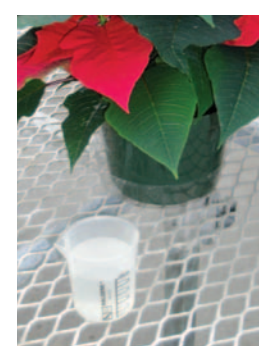
Figure 3. Place saucer under plant to collect PourThru test solution.