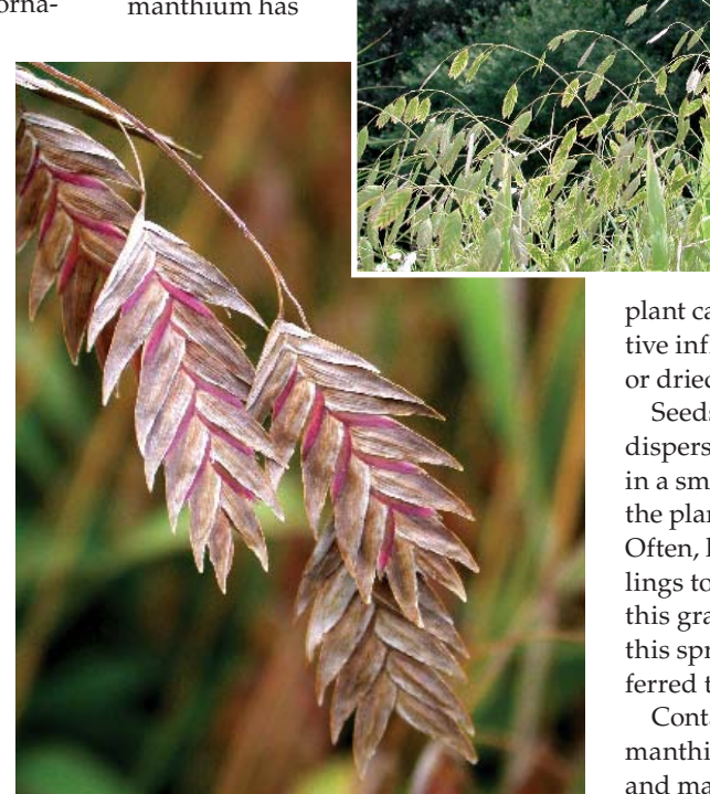
Figure 1A and B. Chasmanthium latifolium plants provide movement and texture to a summer garden, while inflorescences add color and interest to a fall and winter garden.

also been used successfully in urban landscapes and charming containers. Chasmanthium is of particular interest to many gardeners due to its moderate height (2 to 5 feet), deer resistance and its adaptability to shady locations. Many popular ornamental grasses