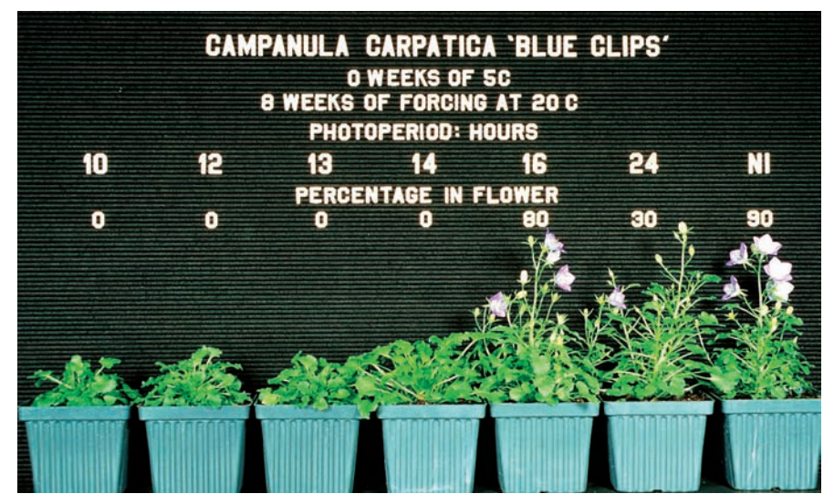
'Blue Clips' were forced under (from left to right) 10-, 12-, 13-, 14-, 16- and 24-hour photoperiod and 9hour photoperiod with 4-hour night interruption provided by incandescent lamps. Sixty percent of plants flowered under 14-hour photoperiod, and all plants flowered under photoperiods of greater than or at 16 hours. Also, flowering under 14-hour photoperiod was slower.

When we moved actively growing 4-week-old 'Birch Hybrid' plugs from 68 to 28° F the plugs often died during vernalization. Since 'Birch Hybrid' is very cold tolerant in the garden and is cold hardy to Zone 4 (-30 to -20° F), we believe exposing actively growing plant material to 28° F does not allow it to harden, resulting in plant death. Therefore, growers who wish to vernalize plants without pre-hardening should avoid vernalizing at or less than 28 °F.