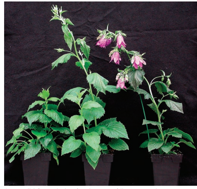
'Kent Belle' flowered when forced at 68° F following vernalization at 41° F for 15 weeks under (from left to right) 9-hour photoperiod and 16-hour photoperiod provided by incandescent and high-pressure sodium lamps. Plants under 9-hour photoperiod flowered later than plants under 16-hour photoperiod.

*Only 0- and 15-week vernalization were test **LD was the only photoperiod tested.