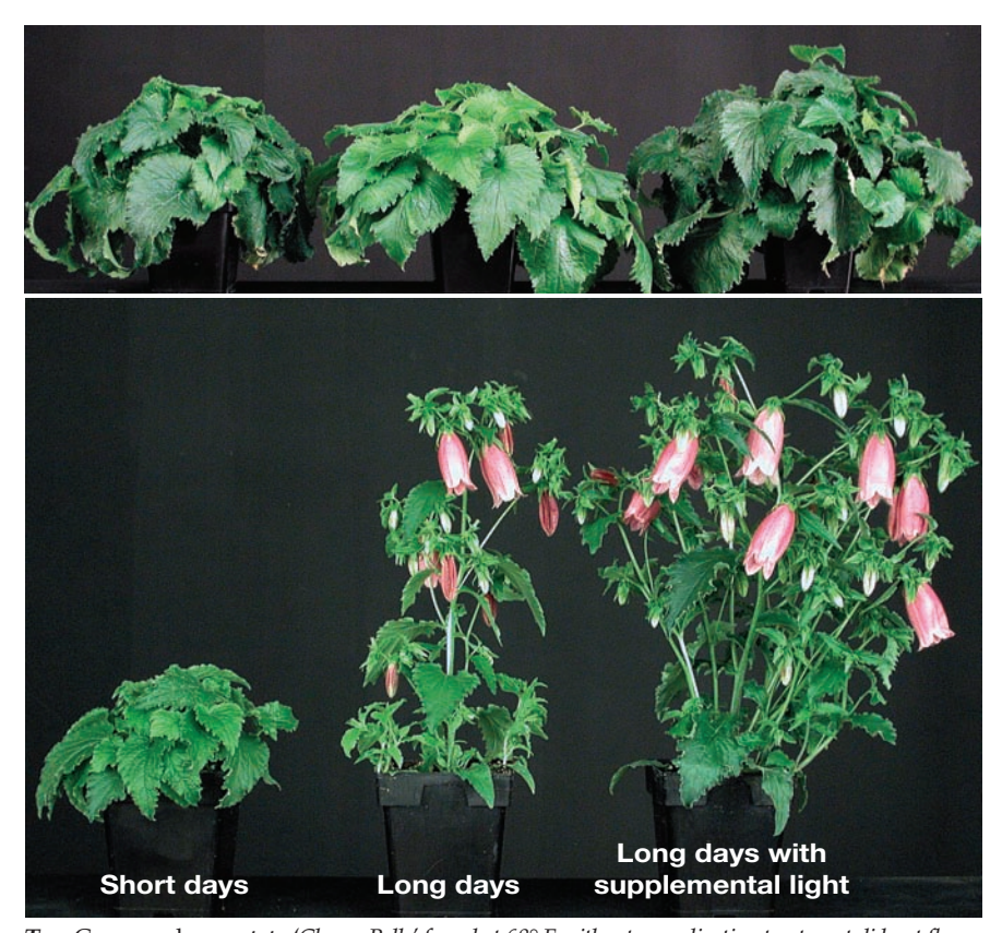
Top: Campanula punctata 'Cherry Bells' forced at 68° F without vernalization treatment did not flower under (from left to right) 9-hour photoperiod, 16-hour photoperiod provided by incandescent lamps and 16-hour photoperiod provided by high-pressure sodium lamps. Bottom: Campanula punctata 'Cherry Bells' forced at 68° F following 15-week vernalization treatment at 41° F (from left to right) did not flower under 9-hour photoperiod but did flower under 16-hour long days provided by incandescent lamps and high-pressure sodium lamps.

ula 'Kent Belle' are reportedly adaptable to high heat and humidity. A few campanulas, including C. rotun difolia , are native to the United States and offer great untapped potential to gardeners and plant breeders looking for new plant material. Smaller-sized campanulas such as C. carpatica form charming mounds of flowers in small containers and are important potted flowering crops. Several campanulas suitable for domestic conditions have been significant to the American herbaceous perennial market. Á