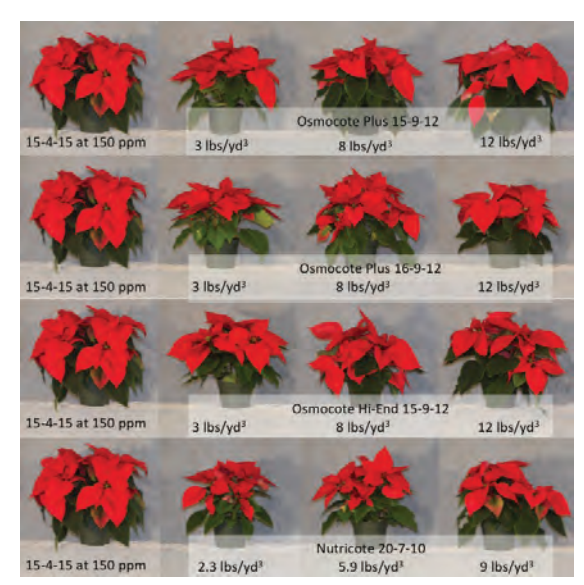
The Growth Index of 'Premium Red' poinsettia was similar for all plants, regardless of fertilizer or rate used.

A second poinsettia experiment was conducted using larger containers and a range of CRF rates. Rooted liners of 'Premium Red' were planted in 6.5-inch containers filled with a commercial soilless substrate amended with Osmocote Plus 15-9-12 or Osmocote Hi-End 15-9-12 (both at rates of 3, 8, or 12 lbs./yd<sup>3</sup>), Osmocote Plus 16-9-12 at (2.8, 7.4, or 11.2 lbs./yd<sup>3</sup>) and Nutricote 20-7-10 at 2.2, 6 and 8.9 lbs./yd<sup>3</sup>. A constant WSF treatment (15-4-15 at 150 ppm N) was also included. In this study, plants were evaluated for growth and marketability.