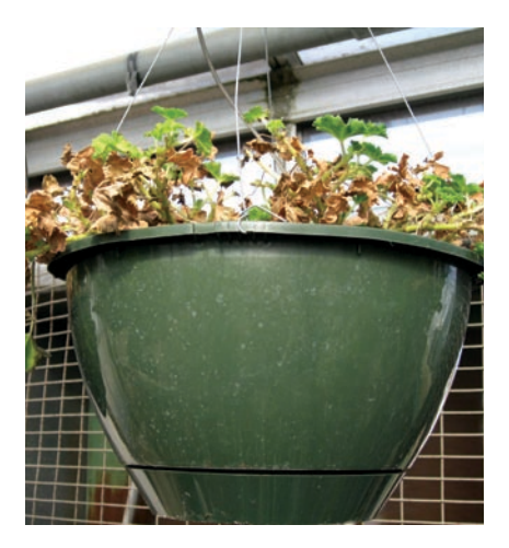
Figure 6. Check your heaters frequently as faulty heaters can release ethylene and damage sensitive crops such as geraniums. Catching a problem early will make treatment much easier and will reduce the number of plants affected.

Once your plants reach the retail environment, it is essential they are provided with adequate environmental conditions to sustain photosynthesis. Low light levels and warm temperatures in post harvest will lead to leaf and flower senescence and overall poor quality. Likewise, low light levels and excessively cold temperatures are detrimental for crops such as poinsettias, orchids, and tropical plants. Ethylene is also a factor that