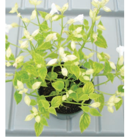
Figure 5. The loss of plants due to diseases, insects, nutritional deficiencies or toxicities and ethylene also contribute to shrink.

Assuming you have minimized your propagation and production