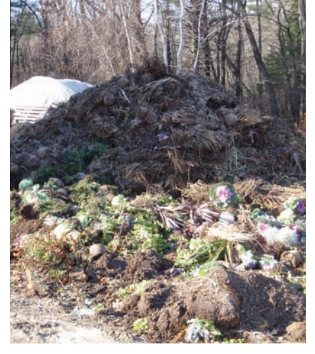
Figure 4. Adding in extra weeks as a "cushion" will cause you to miss your target date or produce plants that will be overgrown and lower quality – both making your compost pile grow.

Look at the plants themselves to identify insects, mites and the damage they cause. Record observations and review these regularly to identify any trends in infestations. Don't get tunnel vision when scouting for insect pests, look for disease and nutritional