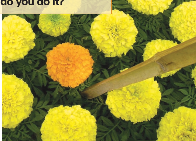
Figure 1. Shrinkage may occur when cultivars do not germinate true to type from seed.

At 10 percent shrink (about the average at retail), Dick and Jane will realize a net profit of only $200. At 20 percent shrink, they will lose money on the crop. Shrink works against us in two ways – it raises the cost that it took to produce each saleable container, and it reduces the number of containers we